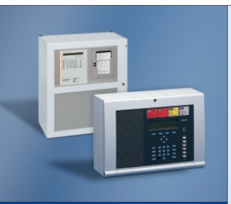
Our central control panels IAP 561-MB256 and FACP 8000 M