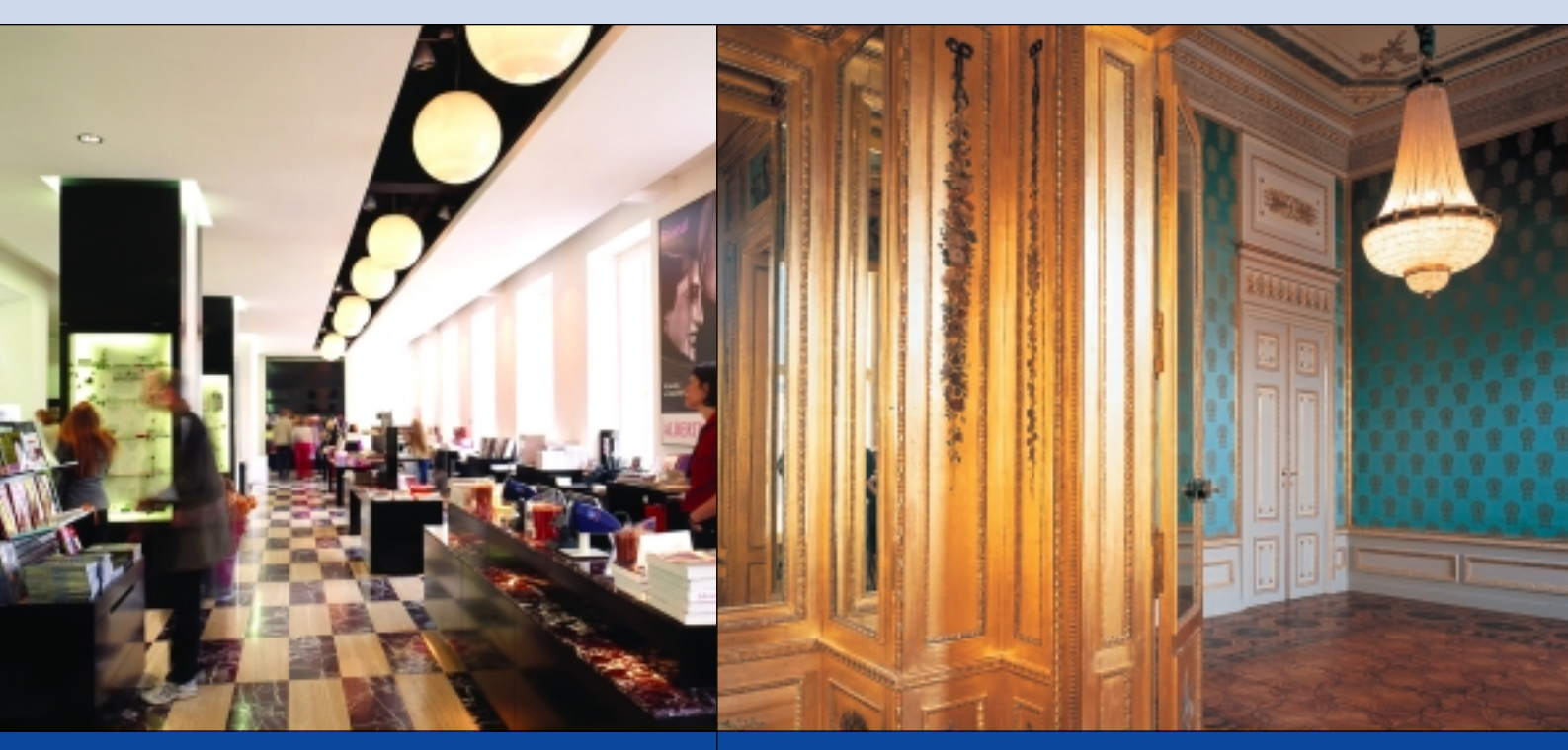
The renovated Albertina is also provided with Novar security technology

The WINMAG control centre programme provides an overview of complex hazard alarm systems with several security systems such as fire, intrusion and access control. With WINMAG, all information is clearly structured and bundled on one PC. The programme also allows user-friendly system operation of a wide range of functions, clearly arranged on one display.