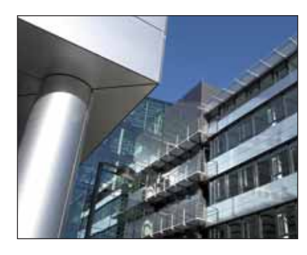
In 2005, 35 million euros were invested in the 16,000 \text{ m}^2 construction